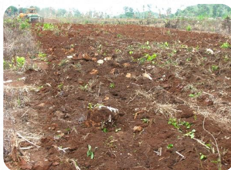
Results of Single Pass in Limestone