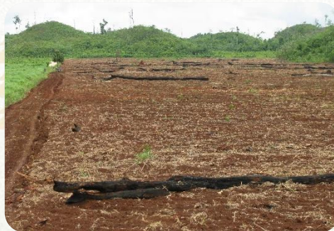
Blade w/ Dozer, then Plow and Bed