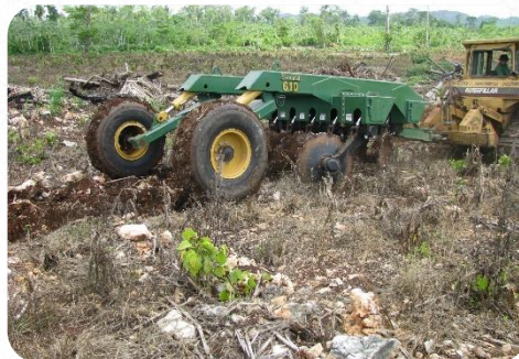
Maximize Marginal Soils With Rocks