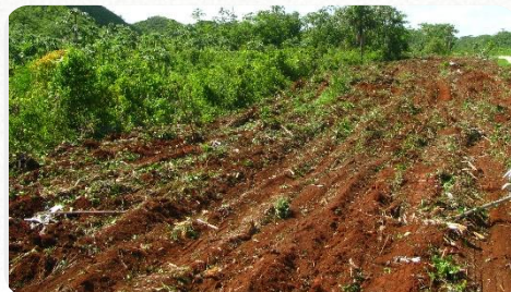
Eliminate 1-2m Tall Vegetation

Virtually Eliminates Grass Re-Growth in Tropical Species Establishments